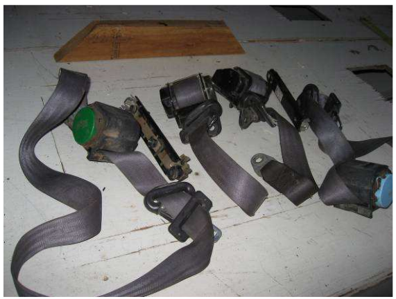
seat belts fits 97- 2003 free

Call Ron Webber 714 649 9836 webbermail@cox.net