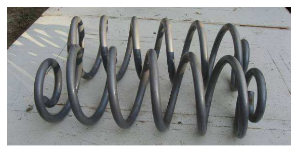
Rear Rubicon Springs 5.5" lift 18" longs used for 3 months before switching to coilovers. retail $175. buy them for $75.00

Call Ron Webber 714 649 9836 webbermail@cox.net