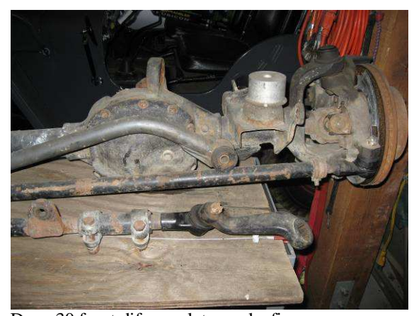
Dana 30 front dif complete works fine. out of my 2000 jeep wrangler TJ 3.56 gear ratio Detroit Locker T&J HD dif cover disk brakes Axles included tie rod, drag link & pan hard rod not included if new cost is $950.00 buy it for $350.00

Call Ron Webber 714 649 9836 webbermail@cox.net