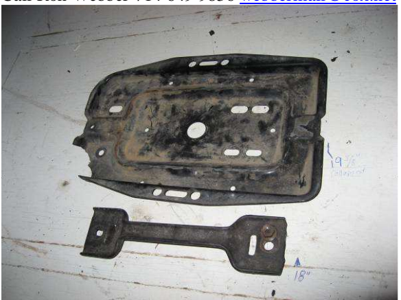
Battery pan & top handle fits 97-2003 TJ Free

Call Ron Webber 714 649 9836 webbermail@cox.net