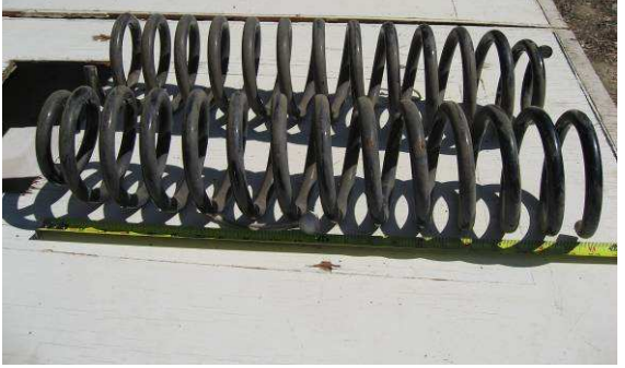
Front Full Traction coil springs 6" lift fits actually 23" long – used for 6 months before switching to coilovers retails for $165. buy them for $75.00

Call Ron Webber 714 649 9836 webbermail@cox.net